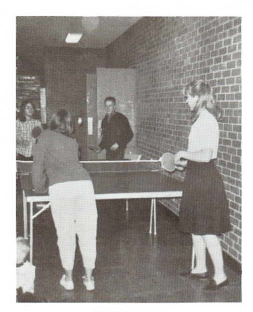
Ping for serve.

oughly enjoyed them. The little ones who could, also had their turn at playing basketball.