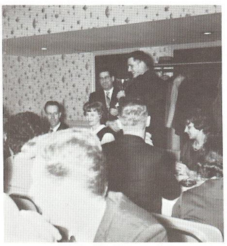
Most effective speaker.

Opening night "jitters" if present at the start, soon vanished in the warm glow of friendly, happy fellowship. It is trom such association as this, that the words Christian and fellowship are joined together and take on a new, truly meaningful significance.