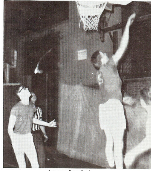
A one hander!

1st Place — Royals (5-0) 2nd Place — Warriors (3-2) 3rd Place — Athletics (1-3) 4th Place — Chargers (0-4)