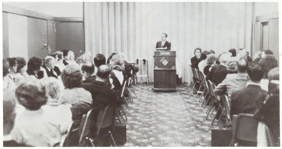
Evaluating the Saturday Nite Club.