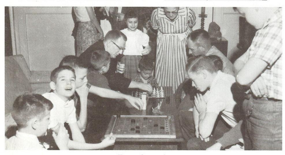
Fun and games!

The trouble with dropouts is not that they cannot see the handwriting on the wall, but that they cannot read it.