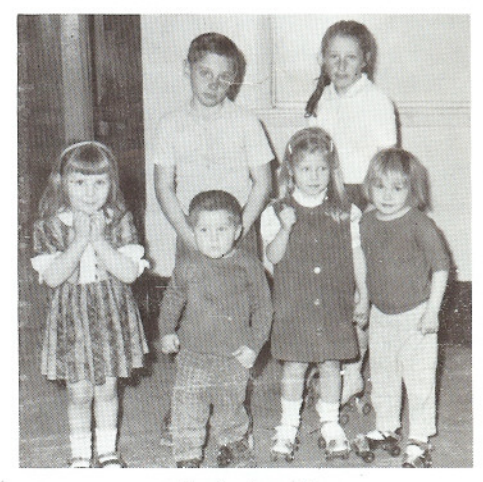
Ready to roll.

We were thankful we have this opportunity for exhilarating exercise, amusement, and fellowship.