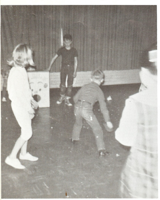
"Bean bag bowling."

After the show, various games were set up for the children, and they thor-