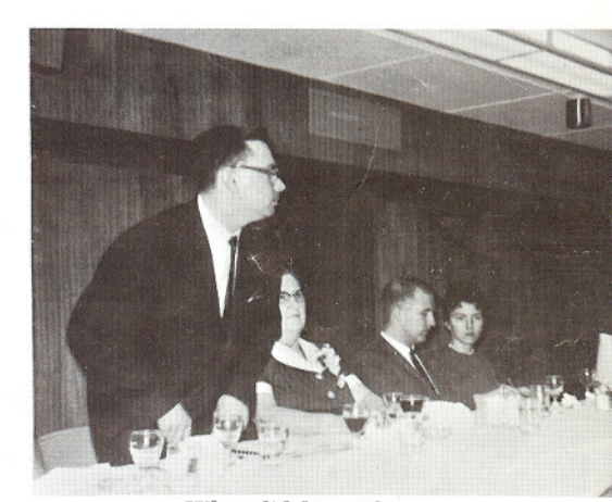
What did he say?