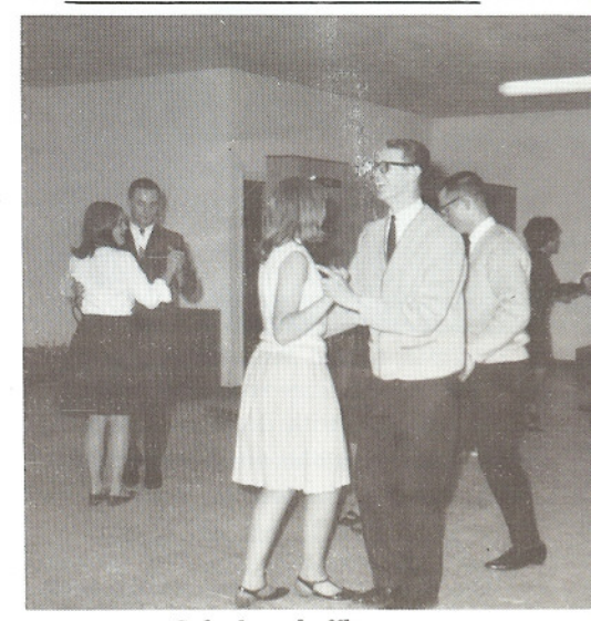
Soft shoe shuffle.