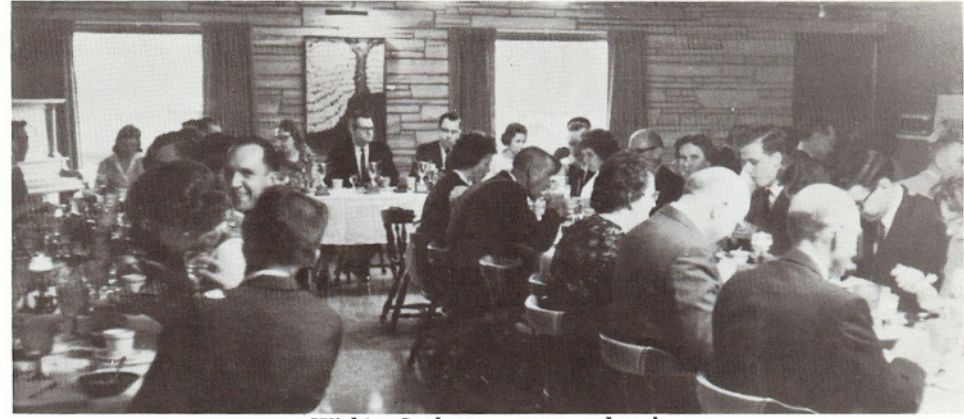
Wichita Spokesmen meet and eat!

The birth of each new nation somehow finds Uncle Sam the babysitter.