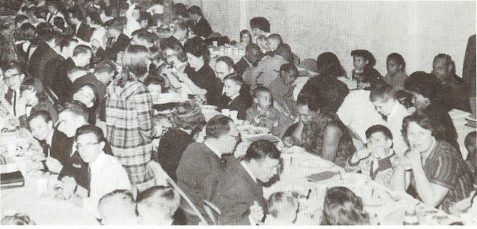
Enjoying the physical food.